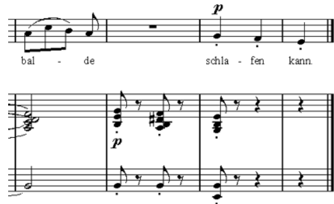
Imported into Finale via MusicXML