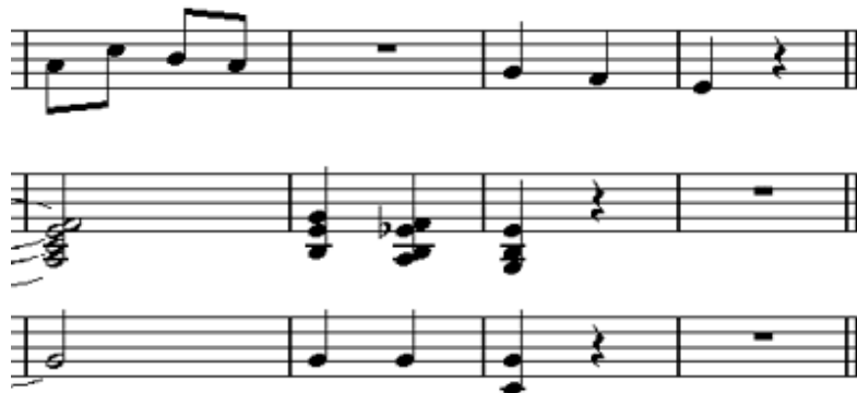
Imported into Finale via MIDI