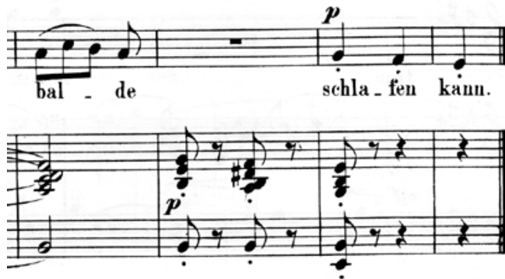
Original as scanned into SharpEye