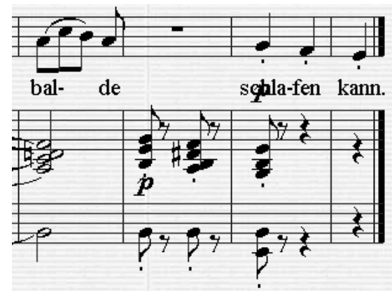
Imported into Sibelius via NIFF